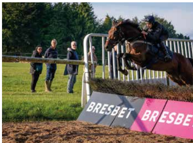
Crambo schooling at home